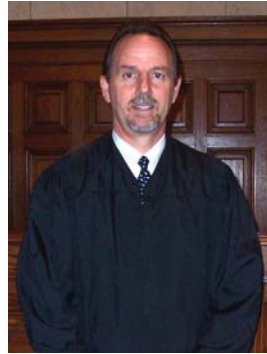
Judge Paul G. Hyman, Jr.

As permitted under Bankruptcy Rule 9029 and United States District Court, SDFL Local Rule 87.1, the judges of this court have adopted local rules which are supplemented by administrative and general orders, clerk's instructions, court guidelines and local forms. These orders, court guidelines, clerk's instructions and forms are promulgated to support the local rules and allow flexibility in changing circumstances.